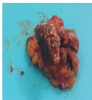
Figure 3: Excised tumor