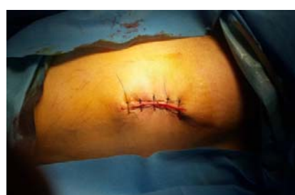
Figure 5: Wound closure