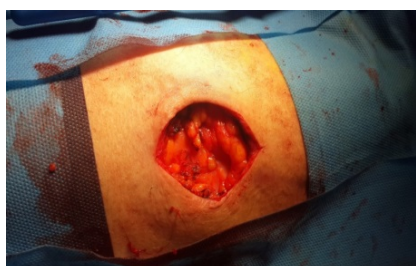
Figure 4: Skin defect after excision