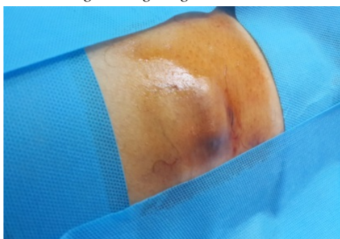
Figure 2: Recurrent mass

Asterisks: basaloid epithelium with acute inflammatory cells, Arrow: foreign body giant cells. Arrow head: Ghost cells characteristically retain their cell and nuclear borders, however, the nuclei lose their basophilic staining leaving a “ghost-like” remnant in eosinophilic keratin debris.